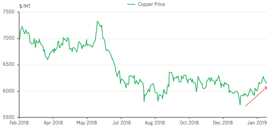
Chart 2: Improving copper prices reflect improving Chinese growth story

Source: Bloomberg, Manulife Asset Management. As of 12 February 2019