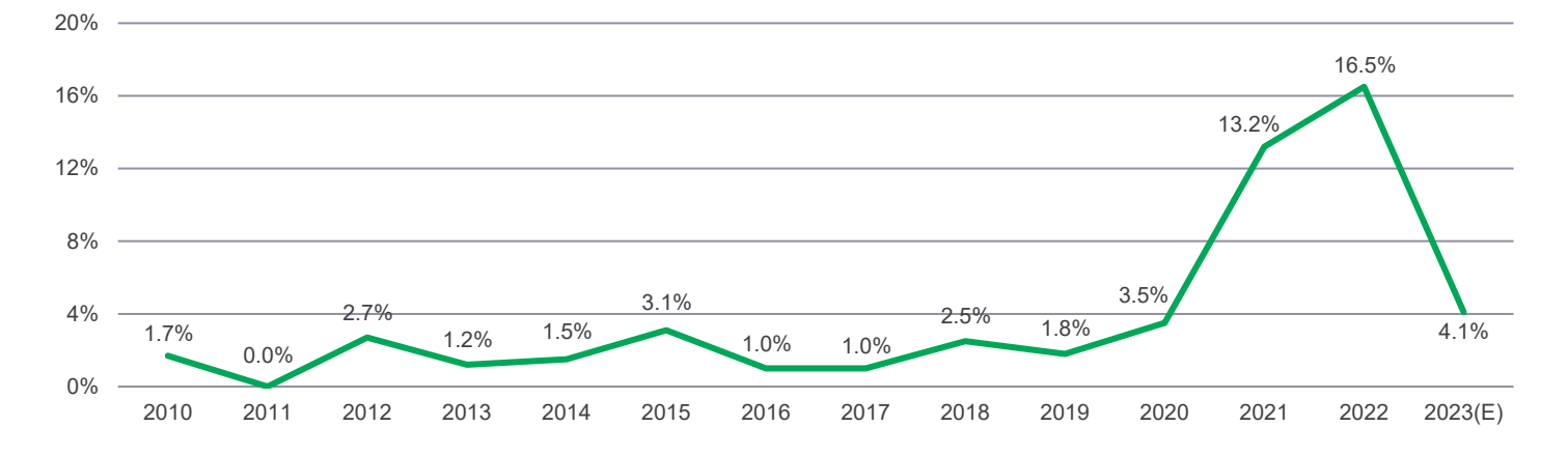
Chart 3: Declining default risk in Asian high yield<sup>6</sup>

• Evidence of improving market sentiment Early signs indicate a nascent rebound in home sales and prices, which remain a