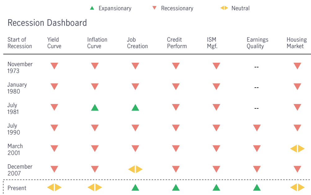
Chart 2: US recession dashboard 9

Of the seven recession signals that we follow in our US Recession Dashboard (chart 2), three are neutral and four are green. According to a study by the US economics team at Bank of America Merrill Lynch, five monthly economic indicators that have been closely linked with US recessions (initial claims, auto sales, industrial production, Philadelphia Fed survey, and aggregate hours worked) suggests that no thresholds were about to be breached 8 .